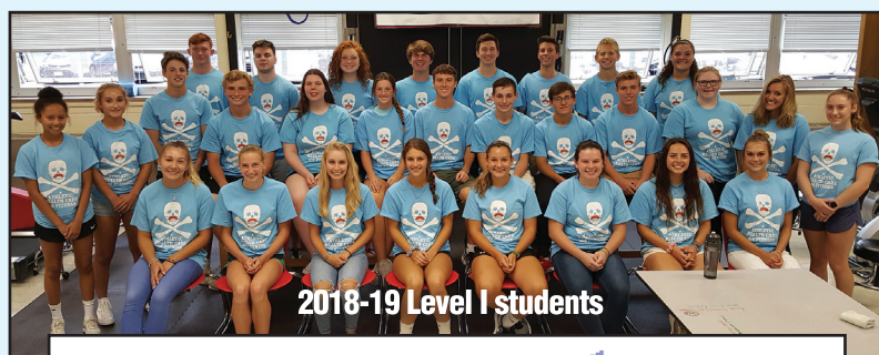
2018-19 Level I students

Off to college—see where our 2018 completers are studying