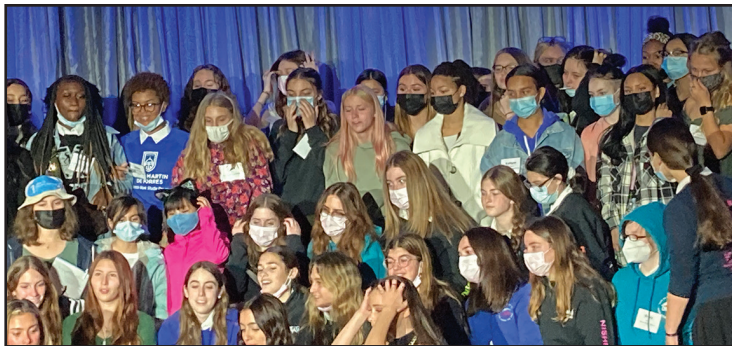
Students attend the Dare to Dream Retreat at John Carroll University