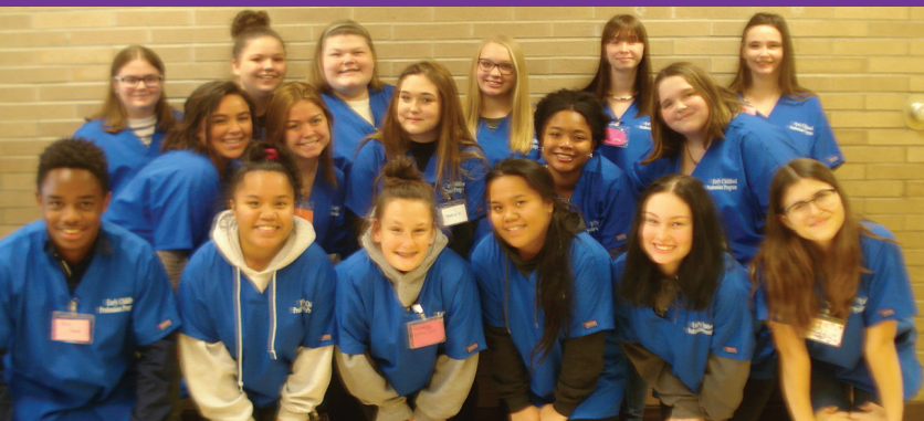
Early Childhood Professions students

News about a Career-Technical Education Program from the Six District Educational Compact