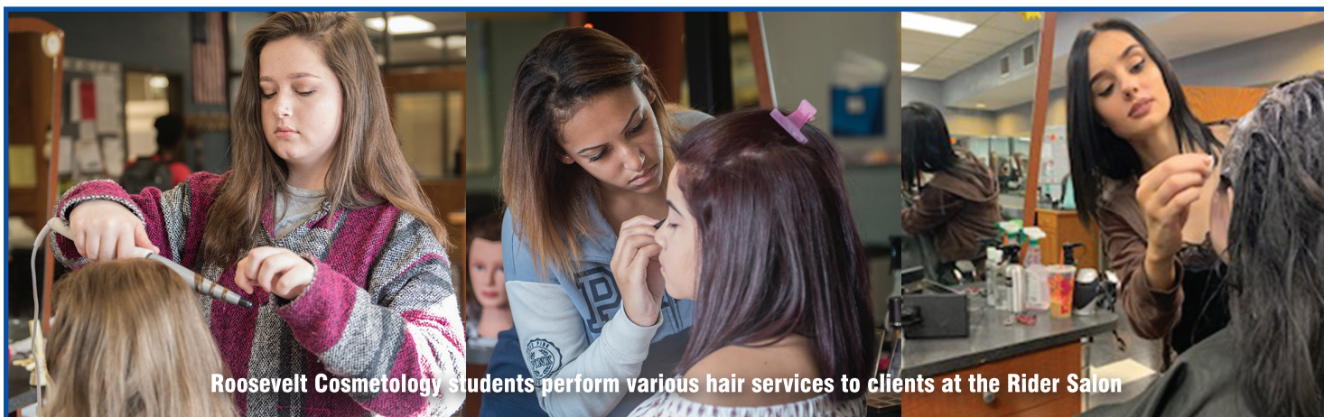
Roosevelt Cosmetology students perform various hair services to clients at the Rider Salon