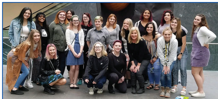
Students at the Cleveland Museum of Art