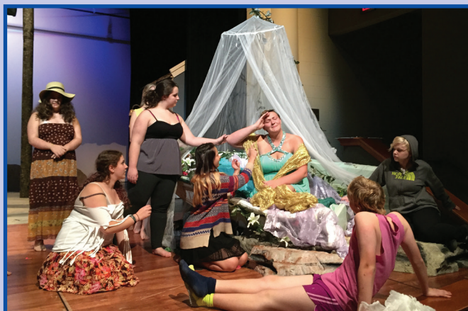
Theater Arts Career Academy students from Hudson and Tallmadge rehearse for "Midsummer/Jersey."