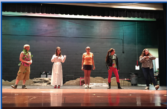
Tallmadge Theater Arts Career Academy students sharpen their skills at dress rehearsal for "Midsummer/Jersey."

Workshops planned for the school year include commercial television and film audition technique, musical audition technique, stage combat, storytelling, slam poetry, intelligent lighting, scenic painting, effects makeup, how to emcee an event and others.