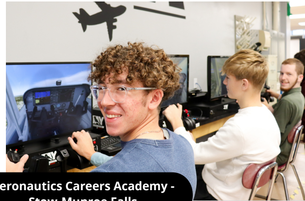
Aeronautics Careers Academy - Stow-Munroe Falls

SCAN THE QR CODE TO EXPLORE MORE AT WWW.SIXDISTRICT.COM