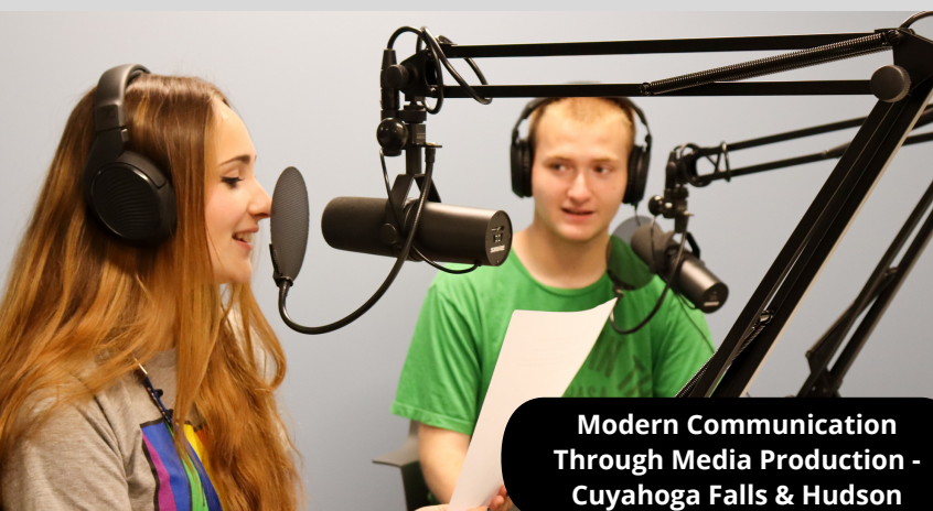
Modern Communication Through Media Production - Cuyahoga Falls & Hudson