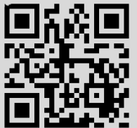
Theater Arts Academy - Tallmadge