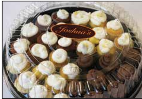
Student involvement for the event provided special touches, including cupcakes baked by Culinary Arts students (pictured) and an opening video created by Interactive Marketing & Design students.

The Compact celebrated its 50 (+3) Anniversary in March at Silver Lake Country Club with a special evening dedicated to honoring the history, future and Compact of today.