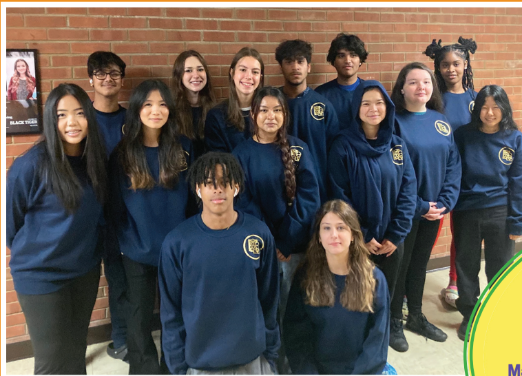
Level I Academy of Medical Office and Business Management

The Academy of Medical Office and Business Management prepares you for a wide-range of professional and post-secondary opportunities! Below is a snapshot of some of the topics covered in our classroom, this semester alone!