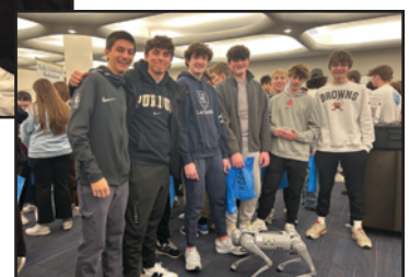
Hudson High School sophomores interact with the robotic dog at the Electronics, Robotics and Programming exhibit