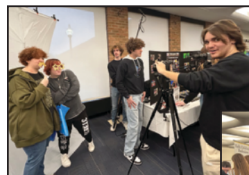
Sophomores from Kent Roosevelt check out Modern Communications through Media Production