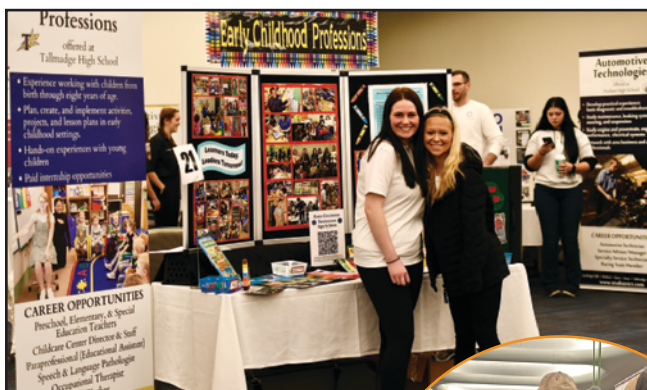
Bright smiles from the Early Childhood Professions student ambassadors as they prepare for the Showcase