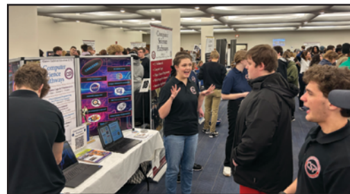
Computer Science Pathways student ambassadors engage with prospective students