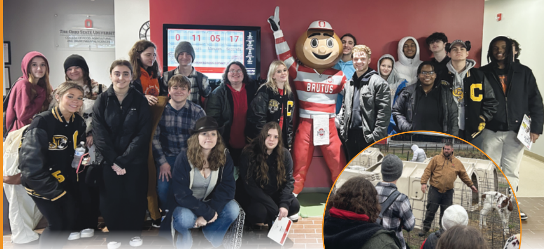
Community Ag students pose with the Brutus statue at OSU ATI