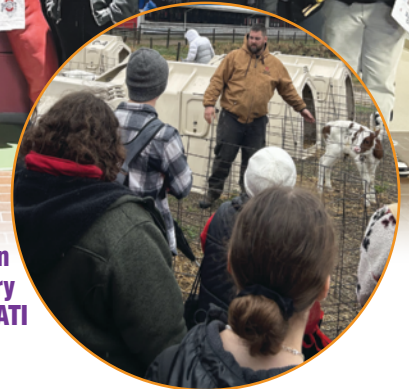
The tour included an up-close look of the dairy production facility at OSU ATI