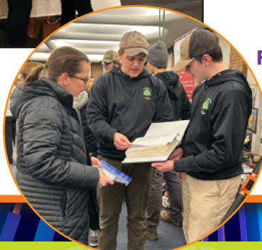
Forestry and Environmental Studies student ambassadors share information with a parent