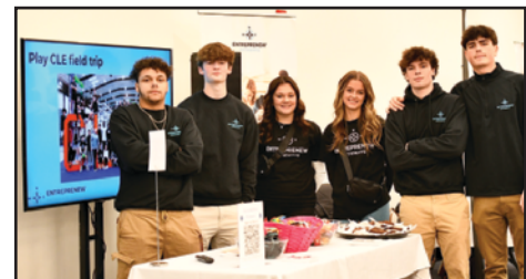
EntrePreNew Pathways student ambassadors brought great energy and enthusiasm to the Showcase